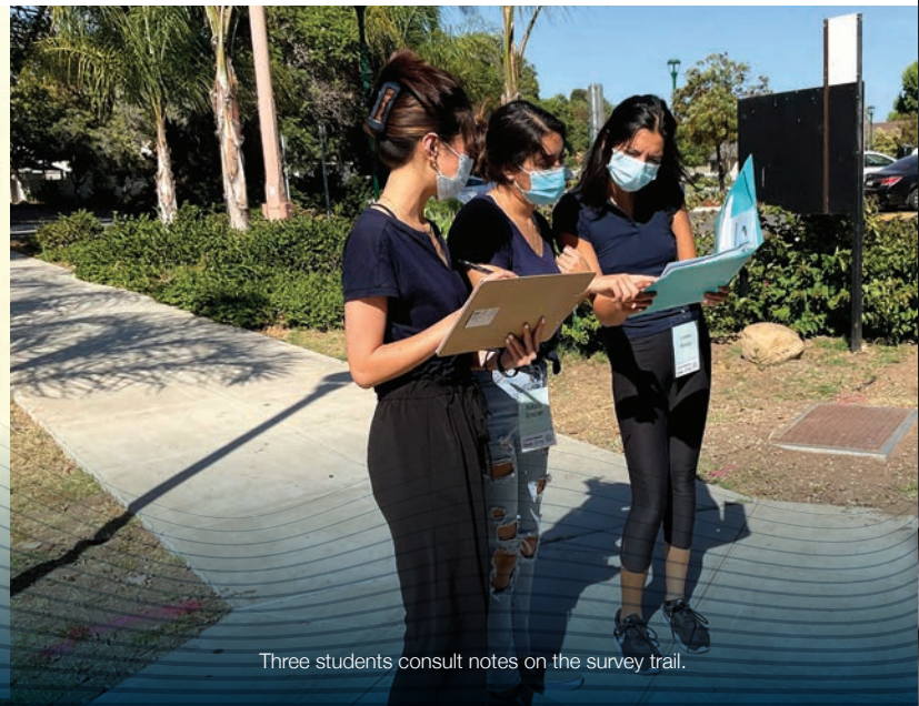
Three students consult notes on the survey trail.

The Gevirtz School believes healthy neighborhoods lead to healthy, higher performing schools. So, for the first time, the School will be joining with Cottage Health, Santa Barbara County Public Health Department, Santa Barbara Promotores Network and other community partners for the Community Health Needs Assessment (CHNA). The CHNA, typically conducted every three years, measures the well-being of Santa Barbara County residents. The data are posted on CottageData2Go.org , where they can be accessed by health providers, non-profit organizations, and the public. As in past years, the 2022 CHNA centers around a countywide telephone and web survey. For the first time this year, the assessment will include door-to-door outreach conducted by UCSB students and researchers with the support of the Promotores Network.