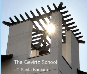
The Gevirtz School UC Santa Barbara